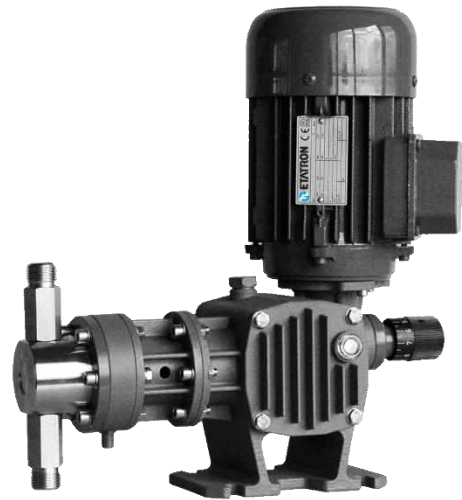
AP motor pump with AISI pump head

Can be built with an ATEX Zone 2 rated motor.