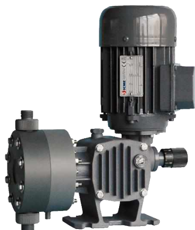
An AD Motor Pump with polypropylene pump head.

Can be built with an ATEX Zone 2 rated motor.